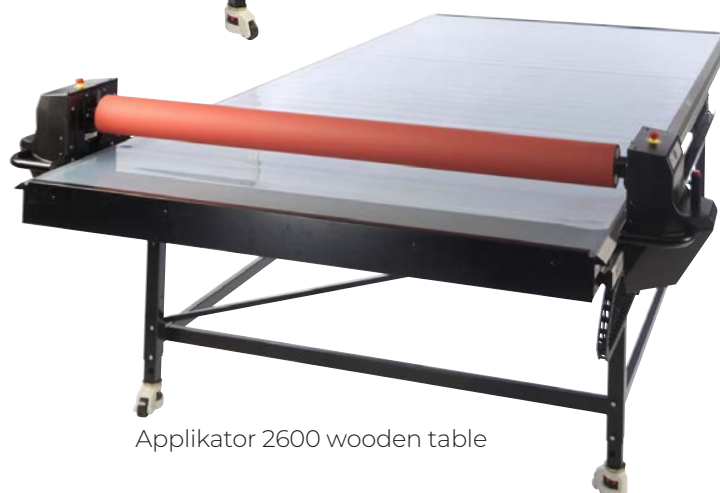
Applikator 2600 wooden table