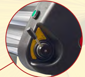
Easy access lever